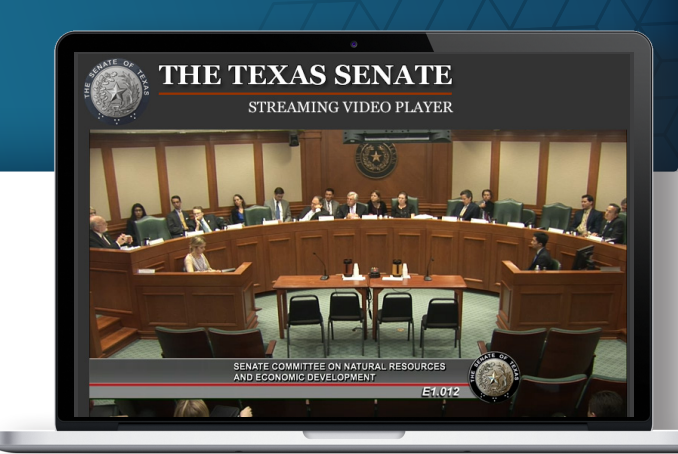
The Texas Senate

For more than 15 years now, Granicus has been unmatched in the industry when it comes to the quality of online streaming video output. This is where Granicus got its start as a company, and it continues to be one of our core competencies today.