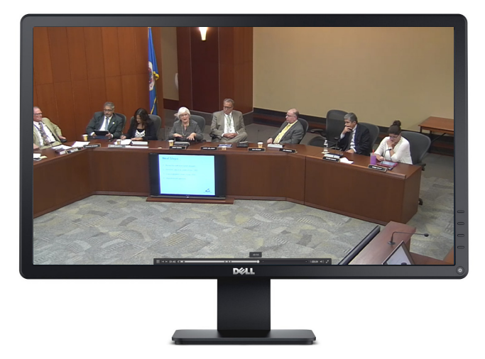
Minnesota Metropolitan Council

When it comes to video quality, obviously High Definition is at the forefront of the conversation. However, what others call "HD" pales in comparison even to Granicus' Standard Definition streaming services.