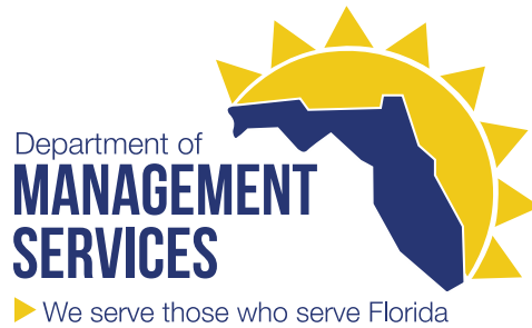
EXHIBIT A ADDITIONAL SPECIAL CONTRACT CONDITIONS

The Contractor and agencies, as defined in section 287.012, Florida Statutes acknowledge and agree to be bound by the terms and conditions of the Master Contract except as otherwise specified in the Contract, which includes the Special Contract Conditions and these Additional Special Contract Conditions.